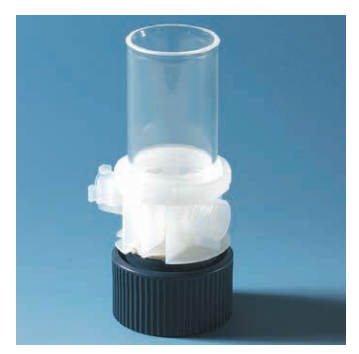
Dispensing cylinder with valve