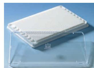
Lids for microplates